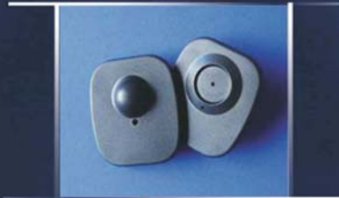
Re-useable Hard tag

This is very popular tag to be use in protecting apparel of all types from delicate lingerie to coats and hats, as well as hard goods such as sports equipment, hardware, electronics , soft toys etc . .